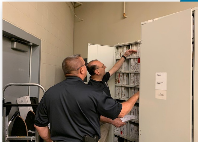
Officers conducting an unannounced evidence inspection.